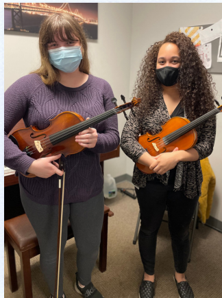
Hope OMEA #1 rating